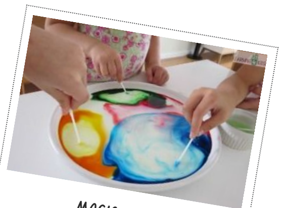
MAGIC MILK

Happy mixing! (with thanks to LEARNING4KIDS for this idea)